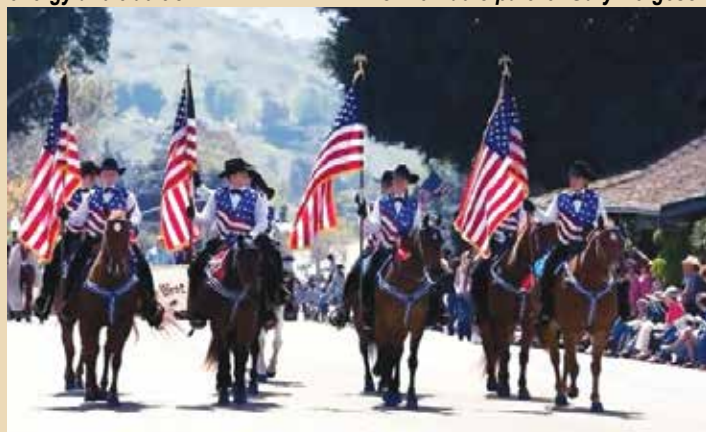
Carrying the Stars and Stripes, this patriotic equestrian team leads the Swallows Day Parade