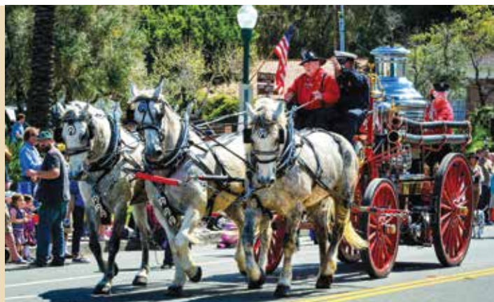
A stunning vintage fire engine, pulled by a team of majestic horses, rolls through the streets of San Juan Capistrano during the Swallows Day Parade

For a stress-free experience, consider taking Metrolink, which drops passengers off at San Juan Capistrano Station, placing them right in the middle of the festivities. Visit swallowsdayparade.org for more information.