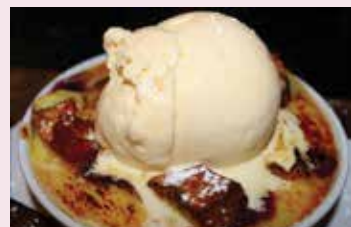
Crème Brûlée Brioche Bread Pudding with blueberries, topped with vanilla bean ice cream