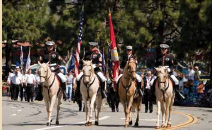
Proudly carrying the Stars and Stripes, The United States Marines lead the Swallows Day Parade