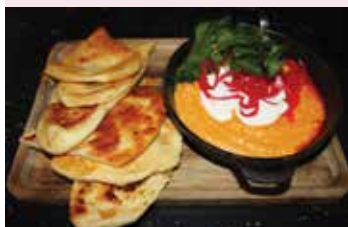
Roasted Carrot Hummus served with house-made naan pickled red onion, and tzatziki

For more information, visit thecorkandcraft.com .