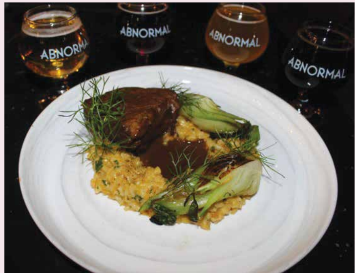
Braised Short Rib served over pumpkin risotto, Bok choy, and a spiced demi-glaze flanked with Abnormal beer pairings

For our main entrée, we had the Braised Short Rib, served over pumpkin risotto, with Bok choy and a spiced demi glaze. The fork-tender short rib was flavorful, with the spiced demi glaze adding layers of richness. Gavin paired this dish with Abnormal Brown Ale, a light-bodied brew with chocolate and toffee notes and a smooth finish. The nutty depth of the brown ale