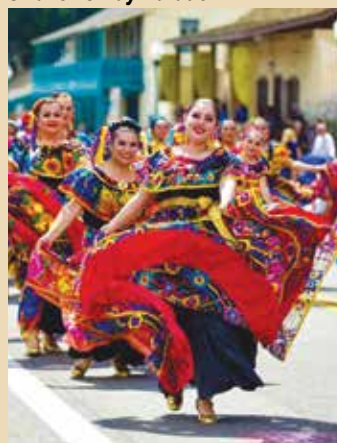
Vibrant folklorico dancers bring energy and tradition